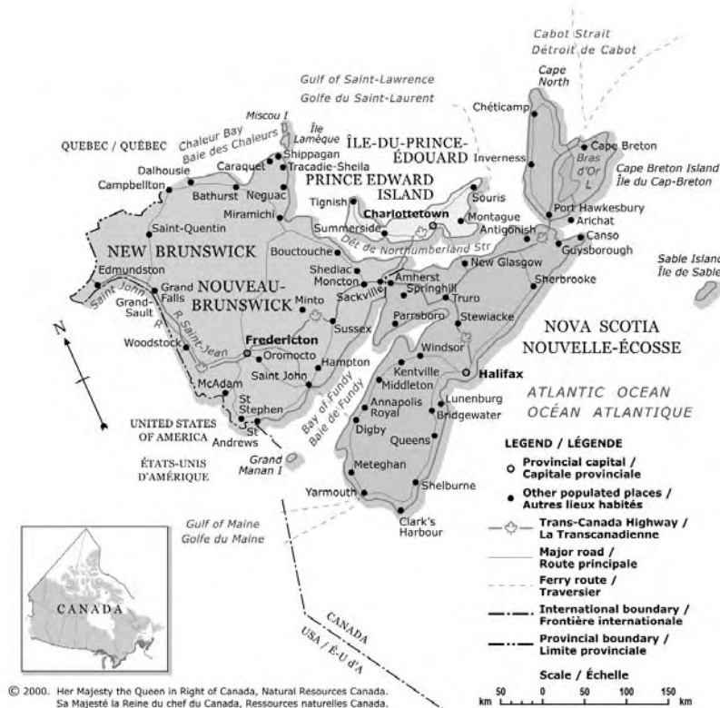
MAP OF THE MARITIME PROVINCES