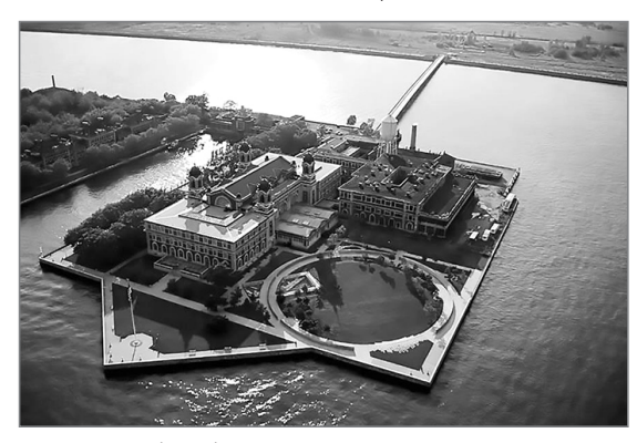
Figure 1 ELLIS ISLAND IN 2016, NEW YORK