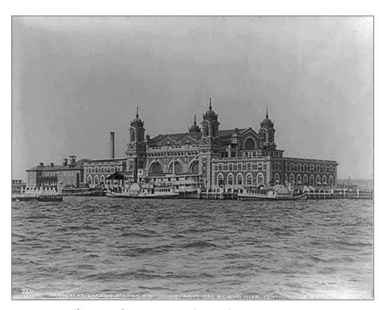
Figure 4 MAIN ELLIS ISLAND IMMIGRATION BUILDING IN 1905